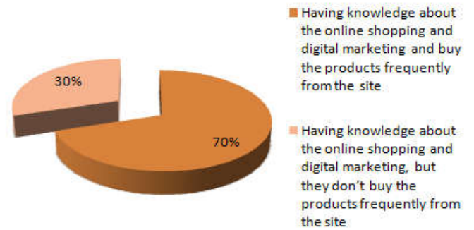
Figure 2 Awareness and buying tendency regarding online shopping