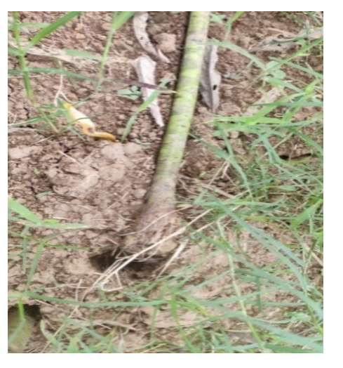
Fig B. Girdling of infected stem