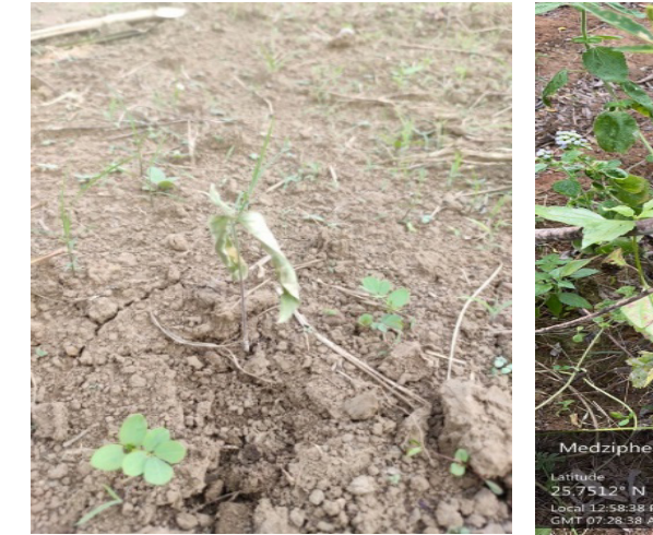
Fig. A wilting of seedling