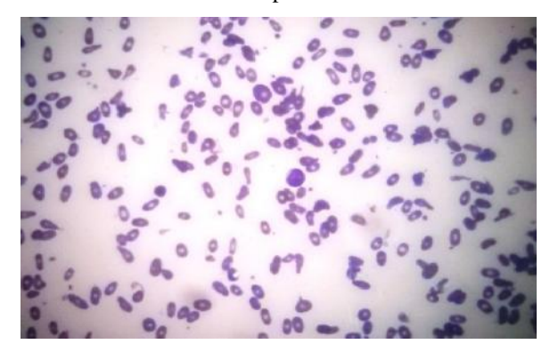
Fig 1 Peripheral Smear Field's satin (X40) showing more than 70% elliptocytes and anisopoikilocytosis

In view of family history of anaemia, past history of blood transfusions and more than 25% elliptocytes on peripheral smear, a diagnosis of hereditary elliptocytosis was given and ancillary tests advised. High Pressure Liquid Chromatography was done. It showed Hb F of 1%, Hb A1c4.4%, Hb A0 64.5%, Hb A2 3.8% and an unknown peak corresponding to Hb D of 22.5%. Hence shewas diagnosed to have Hb D trait. Unfortunately, the patient took discharge against medical advice and hence further work up could not be done.