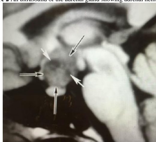
Figure 3 Sagittal unenhanced magnetic resonance imaging (MRI) revealing a huge mass craniopharyngioma