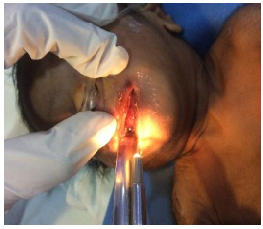
Figure No 2