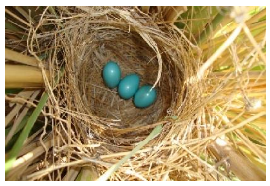
Figure 2 Nest of Common Babbler with eggs