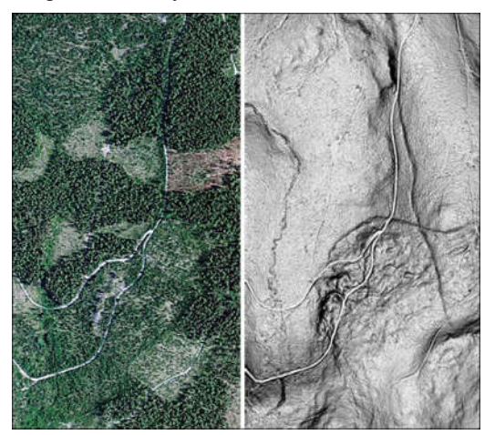
Fig 1 Light Detection and ranging image

New data sources pave the way to think outside the box in how remote-sensing data are used across all disciplines within the O&G industry. For example, surface obstructions such as dense forest have historically been obstacles to finding geologic faults that would otherwise be exposed. But LiDAR sensors calculate multiple returns form an active laser scanner thousands of times per second, resulting in a 3-D representation of the ground (Fig-1). Pulses of light sent from a scanner may bounce off a tree or other object, or they may find the ground (7, 26). As a result, faults that were previously undetected are easily revealed. LiDAR is used for high-resolution surface modeling to augment ground surveys.