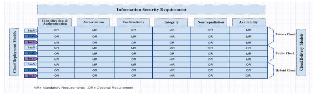
Figure 2 Security Requirements

Public Cloud- Public Clouds are experienced by way of regularly hacking effort.