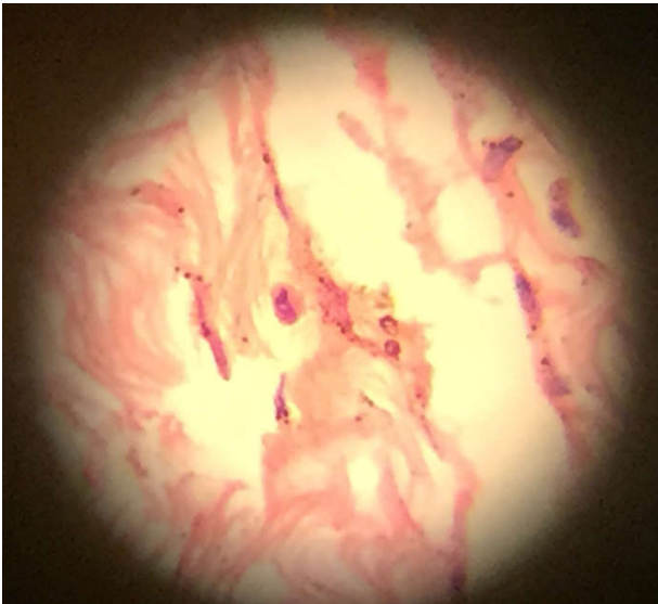
Figure 2 Histopathological section, stained with hematoxylin and eosin, showing blood vessels within stroma in fibrofatty tissue, suggestive of cavernous hemangioma.