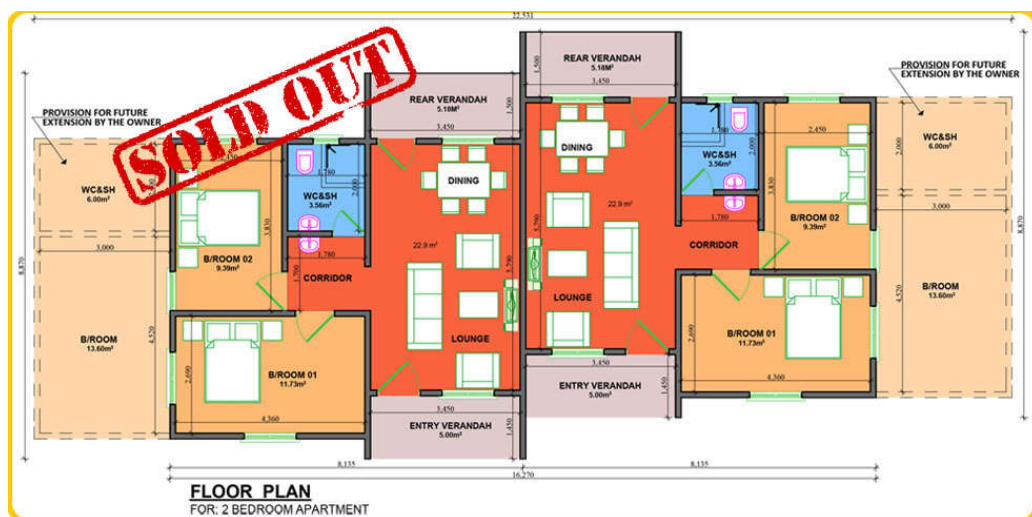
Figure 5 NHC Floor Plan of Two Bedroom Apartment-Kigamboni Housing Project in Dar-es-Salaam

This paper has discussed and answered the question of affordable housing concept and to who it is affordable with reference to Tanzania case. Generally, it has been observed that citizens of countries in Latin America, Asia and Africa have difficulties in accessing adequate housing and hence struggle in various ways to achieve affordable housing from an angle of limited financial resources facing the majority of the people in the world. The global policy of adequate shelter for all by the year 2000 couldn’t be realized because of various reasons including the fact that it was not a realistic. At this material time the affordable housing concept is apparently another unrealistic and a white-elephant housing concept. It has been observed that purchasing power of people is too low especially