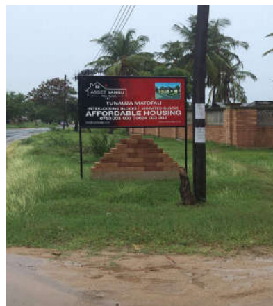
Figure 7 Misconception: Affordable Housing is used to advertise interlocking and vibrated blocks