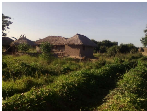
Figure 1 Rural Housing Outlook in Tanzania

of obtaining sufficient food to meet caloric needs and secondly the basic needs poverty line which include non-food essentials.