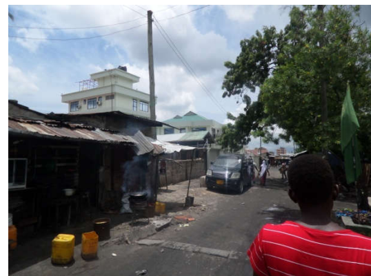
Figure 2 Unplanned and Uncontrolled Urban Housing in Manzese-Dar-es-Salaam in Tanzania

Only 35% of houses in urban Tanzania are in compliance with existing building regulations in terms of spatial planning and building material specifications. URT (2000) admit most housing units in urban areas are constructed without reference to urban development controls and regulations as shown in figure 2 where housing developer can buy-off the urban poor and build a multi-storey housing apartment side by side to the dilapidated urban housing units. Plot coverage and building heights are hardly controlled. Housing survey conducted in 1995 in Tanzania showed 70% of urban population was housed in the unplanned human settlements and more than 60% of the urban housing units were found in these settlements.