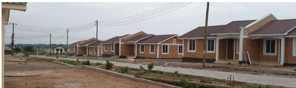
Figure 6 Perspective View of Two Bedroom Apartments-Kigamboni NHC Housing Project in Dar-es-Salaam