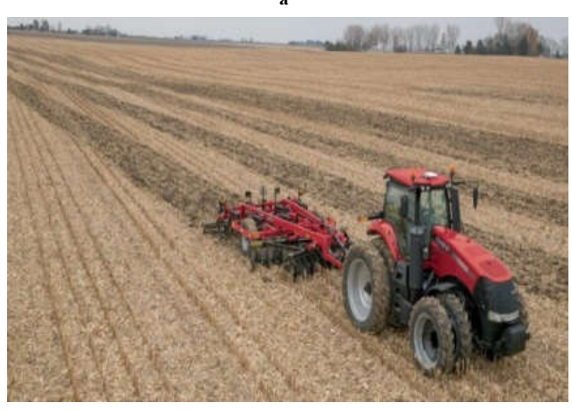
Fig 1(a) Existing Technique (b) Automate Technique