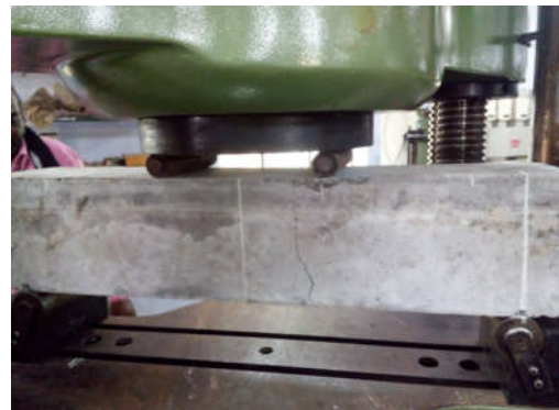
Fig 2 Concrete prism for flexural strength test