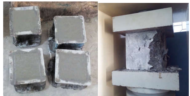
Fig 1 Concrete cubes for compressive strength test

Concrete cube specimens made of various percentage of Quarry Sand were tested at 7, 28 days respectively and the results are presented in the Table 4. The compressive strength increases gradually from 0% to the 50% replacements of Quarry Sand with the River Sand, yields the higher strength of 80.4MPa at 50% replacement and gradually decreases to the 100% replacement. The 100% replacement of Quarry Sand gave the poorer strength. The comparison between the compressive strength of the various replacements are presented in chart 1. The relevant photography is shown in figure 1.