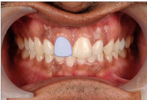
Figure 2 Outline tracing of tooth form