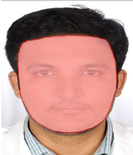
Figure 1 Outline tracing of face form