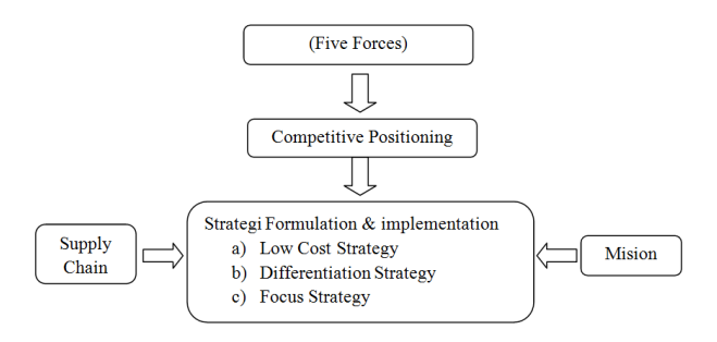
Figure 3 Comparative Generic Porter Strategy Model

Competitive strategy is an approach where companies or industries intensively win every business that includes, as follows: