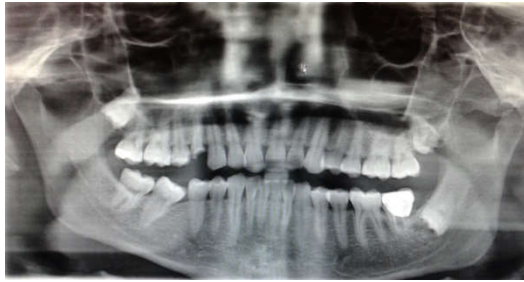
Fig 6 Post Operative