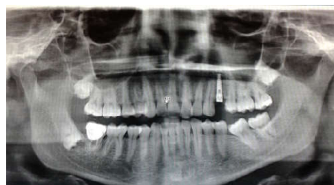
Fig 5 Pre Operative