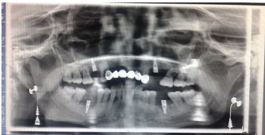
Fig 8 Post Operative