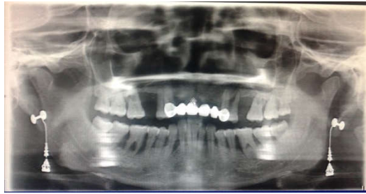
Fig 7 Pre Operative