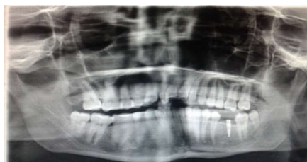
Fig 4 Post Operative