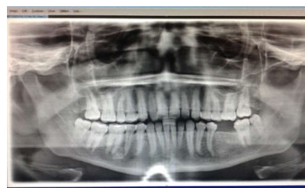
Fig 3 Pre Operative