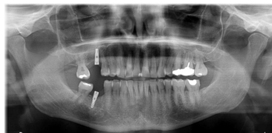
Fig 2 Post Operative Radiograph