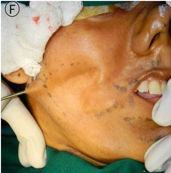
Figure 3 A Demonstrates the markings before fat transplantation. B, Fat graft harvesting from the abdomen. C, Sedimentation of fat into layers (oil, viable fat cells, and RBC's with water and lignocain). D, Removal of the lower layer of RBC's, water and lignocain layer. E, Separation and collection of viable fat cells into the syringe for fat delivery. F, Injection into the recipient site.