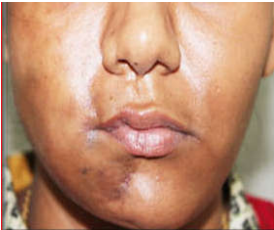
Figure 4 Immediate post-operative results