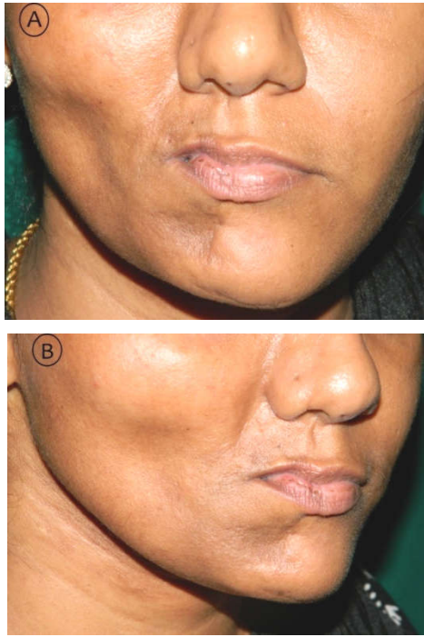
Figure 1 A, B Frontal and lateral view of the patient with Parry-Romberg syndrome