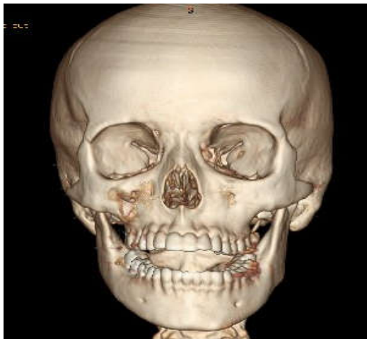
Figure 2 3D reconstruction image showing minimal bony involvement