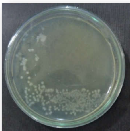
Figure 1 Isolate S3 on Nutrient agar medium

In this study 16 bacterial strains (S1-S16) were collected from 2 different petroleum hydrocarbon contaminated soil samples by using Bushnell Hass medium with 1% petrol out of the 16 strains, 1 potent strain was selected based on their improved hydrocarbon degrading capacity (Figure 1).