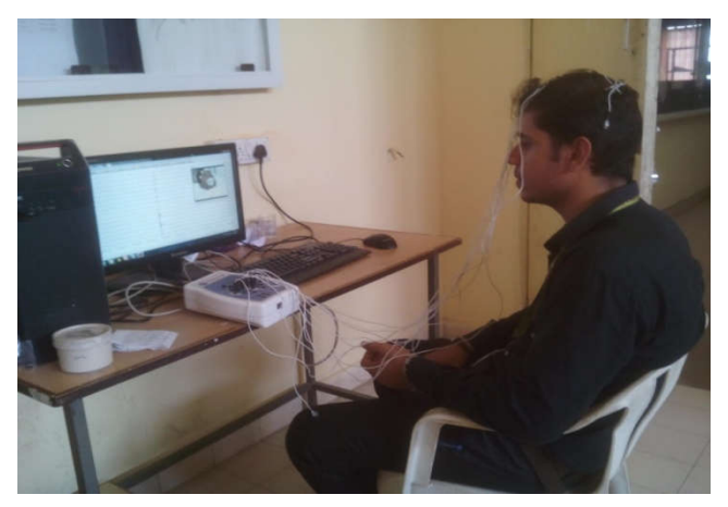
Fig 3 RMS Maximus 32 EEG machine

controlling the on / off of light bulb and fan marked to its efficiency is been calculated.