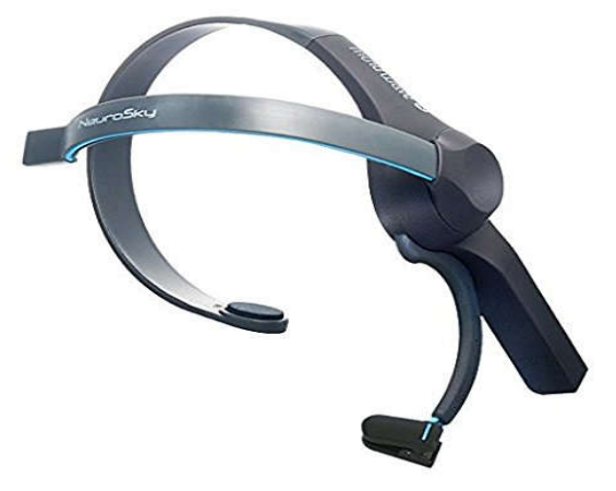
Fig 2 Brainwave Neurosky Headband

It is preferred over the invasive type because it is used for normal healthy humans in daily applications because of its noninvasiveness. In areas like Brain controlled robot via Bluetooth the EEG collected from the Brain through Neurosky headset which is a non-invasive kind [10].