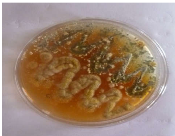
Fig 3 Synergism between Aspergillus sp and Penicillium sp

Aspergillus sp and Penicillium sp were studied for synergistic activity. It was found that both the culture grow well together and showed positive result for synergism as shown.