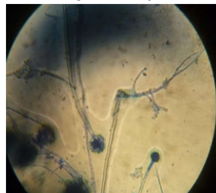
Fig 2 Aspergillus sp.