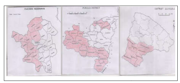
\label{eq:main_problem} \mbox{Maoist dominated Blocks of Paschim Midnapore, Purulia and Bankura District,} \\ \mbox{W.B}

The western part of South Bengal including a major part of West Midnapore, Bankura and Purulia District is now literary marked as Jangalmahal. The name says that the major part of this region is covered by forest or jungle and now a days the socio-economically backward region is strongly Maoist affected. Among the twenty ten blocks of West Midnapore District twenty five are extremely Maoist (i.e. Jhargram, Jamboni, Lalgarh, Belpahari, influenced Sankrail etc). A major part of Purulia District also exists under Jangalmahl. Among the twenty one blocks twelve are found in increasing Maoist activities (i.e. Manbazar | & ||, Arsha, Ragunathpur, Banduan, Balarampur and Baghmundi etc). Now a days the Maoist activity is gradually increasing at the remote blocks of Bankura District which are mainly located in the Southern part of the district (i.e. Ranibandh, Raipur I & II and Simlapal etc).