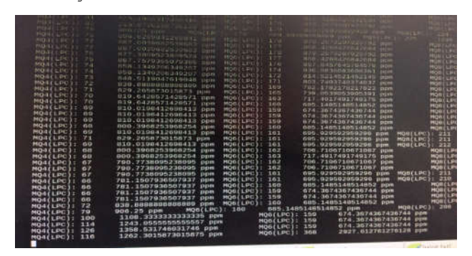
Figure 3 Screen shot of the Measured gas concentration

The HGDAS System is a portable and convenient system that can be easily turned on. The touch panel is basically used to initiate (start) the system. The threshold levels are set in the code in prior for alarming. The system has a provision to turn on live display of graphical information of gases. Since there are two procedures such as static and dynamic display the dynamic display is chosen when the system is on test. The Fig 3 shows the display of the measured gases which is sensed continuously.