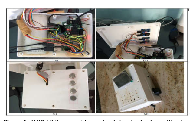
Figure 2 HGDAS System (a) Lower level showing hardware Circuitry, (b) Gas Sensors on the intermediate level, (c) Sensors placed on the upper side of the Intermediate Level, (d) Upper level of the HGDAS system with Buzzer and touch panel

This can be optionally used when the graphical display of the gases detected in the test environment is to be plotted (real time). The GUI has two procedures static and dynamic. In static the data that is stored in the memory can be consolidated and displayed. Whereas in dynamic procedure the real time information of different sensors can by plotted instantly. As the system is powered on the sensors are initialized and are ready to measure the gases in the test environment. The system is designed to provide an alarm when the gases detected by the sensors exceed the threshold level. The system can continuously measure the variation in the concentration of the gases and print the value on the screen. These values that is measured are pumped (logged) in to the memory continuously. Depending on the requirement the GUI script can also be instantiated for real time display of the gas concentration or statically load the logged data to study the environment. In this system the GUI is designed such that the sensor information can be viewed. The dynamic plot is loaded only when the system is turned on, where as the static plot can be used otherwise even when the system is not in use. Both the static and dynamic plot is shown in the figure. Basically the static plot represents the long run logged data where variation in different environments can be simultaneously viewed over a period of time.