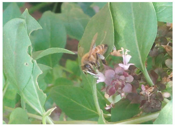
Figure 1 Apis mellifera pollen forager on Ocimum basilicum bloom

A. mellifera and A.cerana (Fig.1&2) started their foraging activity at about 900 and 1030 hours in the morning while their cessation time was 1645 and 1715 hours respectively. A. cerana commenced foraging earlier in the morning as compared to A. mellifera while the later species worked upto more time in the evening.