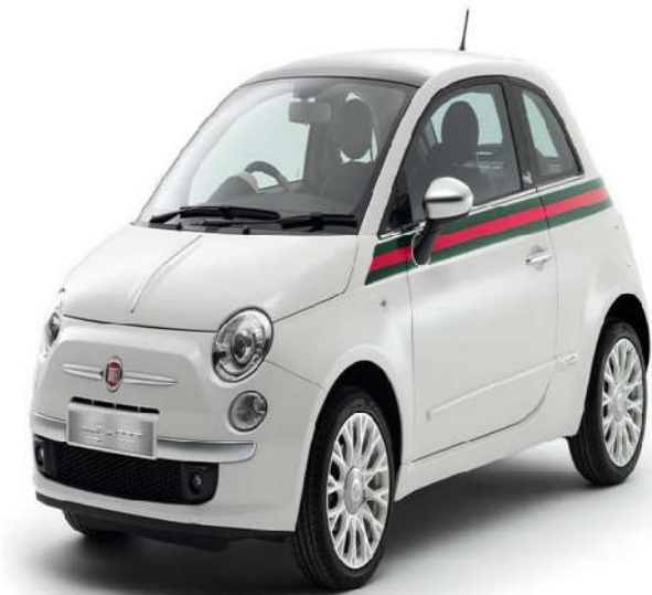
Figure 1 Fiat 500 Gucci Black and Fiat 500 Gucci White