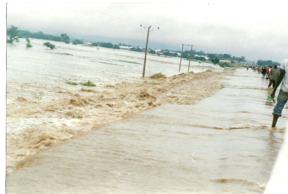
Plate 2 The over flooded Jalingo – Wukari road

The situation reveals the weakness of the State Emergency Management Agency (SEMA) and various stakeholders in responding to emergency disaster situations in the study area. Even NGOs and members of the Nigerian Red Cross Society were not seen at the scenes of the incidence through out the period of the flood.