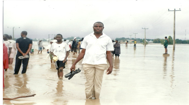
Plate 1 Helpless crowds on the over flooded Jalingo – Wukari road

The findings of this study shows that in the 2005 flood disaster in Jalingo metropolis, government agencies and stakeholders responded promptly and made concerted effort to disperse the crowds from the Nukkai Bridge because of their perceived danger of the bridge collapse. Unfortunately, many of them lost their lives when the Nukkai Bridge suddenly collapsed including an Assistant Police Commissioner (IFRCRCS, 2005). However, during the 2011 flood disaster in Jalingo metropolis, the disaster management response was very poor. Many people gathered on the over flooded Jalingo – Wukari road and the Jalingo bye pass road at the edge of the bridge as seen in plates 1 and 2 to catch a view of the flood extent. The people forgot that this was exactly how over 100 persons were drawn in the last flood disaster when the Nukkai bridge suddenly collapsed. SEMA/NEMA personnel went round on situation assessment of the level of damages caused by the flood. No effort was made to disperse the crowds from the over flooded Jalingo – Wukari road which was a potential disaster scene during the flood.