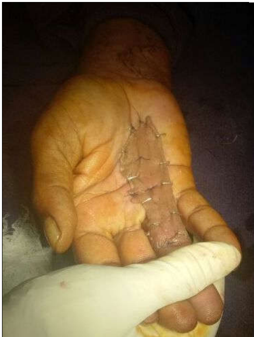
1. Clinical picture of patient with bilateral Dupuytren's contracture 4. Split thickness skin grafting after tendon transfer