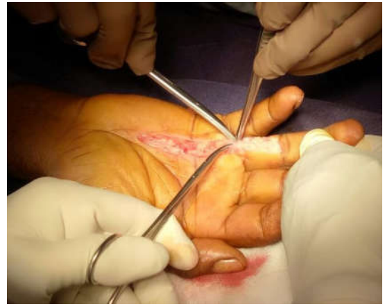
2. Incision and shortening of flexor tendon of ring finger