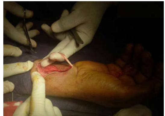
3. Palmaris longus tendon transfer and flexor tendon repair