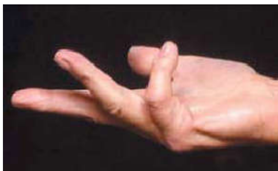
Fig 1 Dupuytren's cord, causing metacarpophalangeal and proximal interphalangeal contracture of the little finger

Prevalence varies widely according to the selected population, ranging from 2% to 42%. 4 A strong familial component is recognised, and the pattern of inheritance has been suggested to be autosomal dominant with variable penetrance. Men typically present earlier (mean age 55 years) than women (10 years later) and have more severe disease.