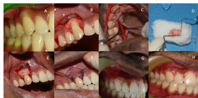
Figure 2 (a) Class 1 gingival recession in 13, (b) Coronally advanced flap procedure, (c) Connective tissue graft(CTG) harvesting, (d) CTG dimensions (e) CTG adaptation, (f) Flap advancement and approximation, (g) Review at 3 months and (h) Review at 6 months