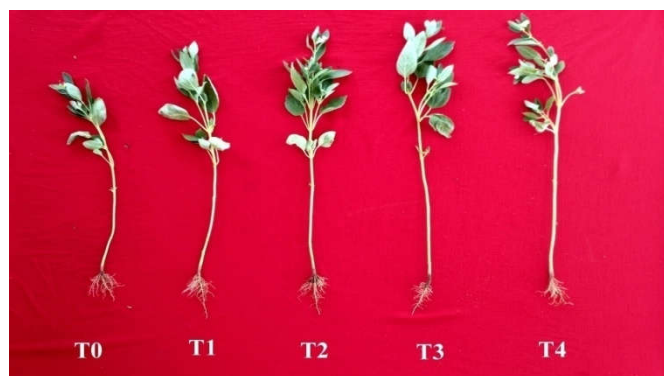
Plate 3 Growth of Sesamum indicum L. on the 60 th day