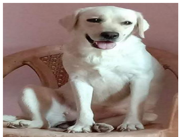
Figure 1 Two year old female Beagle dog.

The ventral midline area from xiphoid region to pubis was prepared aseptically for the surgery. The bitch was pre-medicated with Atropine sulphate @ 0.04 mgkg -1 body weight SC -1 and mixture of Ketamine HCL @10mgkg -1 and Diazepam @ 0.5 mgkg -1 IV -1 as an induction and maintained general anaesthesia with 2–3% Isoflurane. Removed black natural pebble stone with enterotomy incision on dilated bowel on proximal side. Closure of incision with routine manner. Post operatively intravenous fluids DNS, RL and Metrogyl for rehydration, Ceftriaxone antibiotic for five days and Melonex as a pain killer for three days. Withheld water intake for two days and food for 5 days. The bitch showed progressive signs of improvement in the post-operative period. The skin sutures were removed 12 th day post-operatively and the animal made an uneventful recovery while similar findings observed in dogs and cat (Poggiani et al. , 2020, Lopez et al. , 2020, Wells et al. , 1995, Westgarth et al. , 2013).