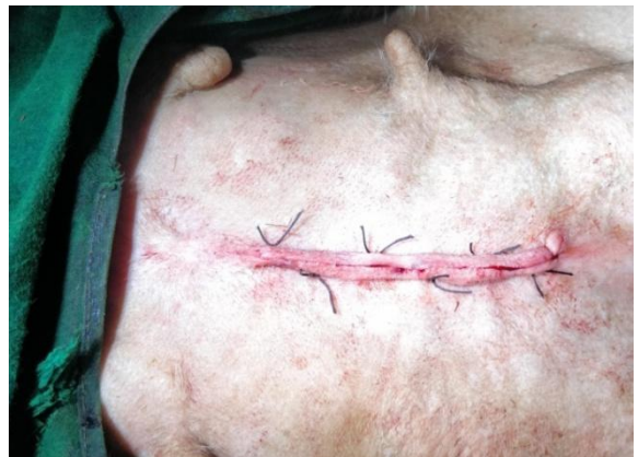
Figure 7 Skin sutures.