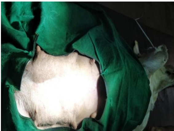
Figure 3 Preparation of surgical site.