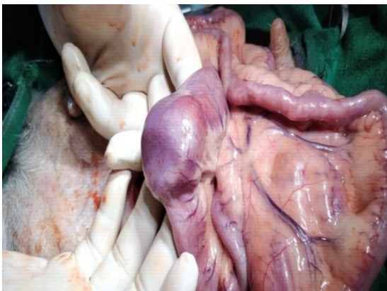
Figure 4 Distended bowel due to Foreign body.