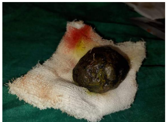
Figure 8 Retrieved of black natural pebble stone