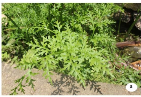
Plate -1 Ceratopteris thalictroides (L.)Brongn.

followed by phloem tissues in C.thalictroides was supported by the findings of Tiwari et al. , 1985 (Plate 2).