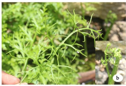
a) Habit; b) Fertile pinnae. Plate 2: Anatomical studies of Ceratopteris thalictroides (L.)Brongn.