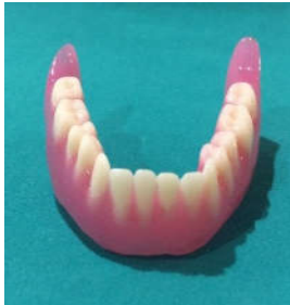
Fig 7 Mandibular complete denture