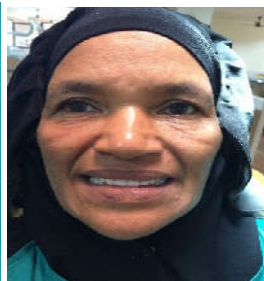
Fig8 Denture insertion