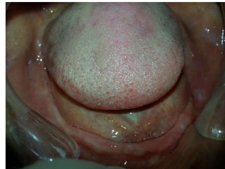
Fig 1 Resorbed mandibular ridge

Providing stable mandibular dentures for patients with severely resorbed mandibular ridges is a challenge. One can overcome this problem if dentures are fabricated with their contours harmonizing neutral zone. The neutral zone is the potential space between the lips and cheeks on one side and the tongue on the other. It is the area where the forces between the tongue and cheeks or lips are equal. When the residual alveolar ridges have resorbed significantly, denture stability and retention are more dependent on the correct position of teeth and contour of the external surfaces of dentures. The advantage of this method is prosthetic teeth do not interfere with normal lower denture space, muscle function; and the forces imparted by normal oral and perioral muscle activity against the complete dentures serve to stabilize and retain the prosthesis rather than cause denture displacement 7 . Through this technique a prosthodontist attempts to duplicate the natural function with an artificial substitute. The neutral zone technique can be employed in conditions where either the implant placement is contraindicated or if the treatment is not economically feasible for the patient.