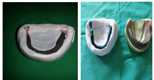
Fig 3 Putty index around the neutral zone impression