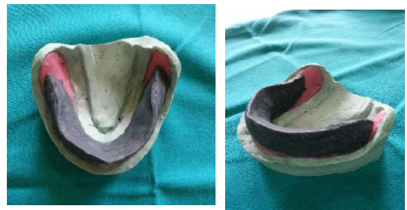
Fig 2 Neutral zone impression