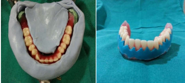
Fig 5 Mandibular teeth arrangement in neutral zone