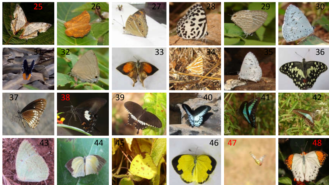
Fig. No 2. 25. Cyrestis thyodamas , 26. Ariadne ariadne , 27. Amathusia phidippus , 28. Castalius rosimon , 29. Jamides celeno , 30. Megisba malaya , 31. Talicauda nyseus , 32. Chrysozephyrus sp, 33. Loxura atymnus , 34. Spindasis sp, 35. Neopithecops sp, 36. Papilio demoleus , 37. Papilio dravidarum , 38. Papilio helenus , 39. Papilio polytes , 40. Papilio polymnestor , 41. Graphium sp, 42. Graphium sp, 43. Catopsilia pyranthe , 44. Eurema laeta , 45. Eurema sp, 46. Eurema sari sodalis , 47. Delias sp, 48. Hebomoia glaucippe