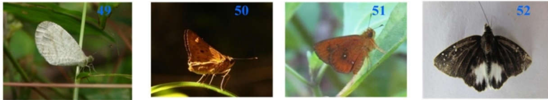
Fig: No 3. 49 Leptosia nina , 50. Hylephila phyleus , 51. Iambrix salsala , 52. Satarupa sp