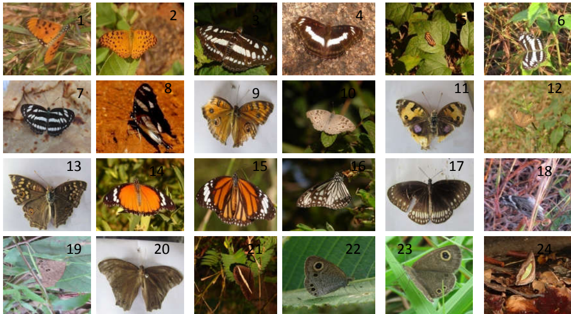
Fig. No 1. 1. Acraea sp, 2. Phalanta phalantha , 3. Athyma perius , 4. Athyma selenophora , 5. Lasippa sp, 6. Neptis sp, 7. Neptis hylas , 8. Hypolimnys misippus , 9. Junonia almana , 10. Junonia atlites , 11. Junonia hierta , 12. Junonia iphita , 13. Junonia lemonias , 14. Danaus chrysippus , 15. Danaus genutia , 16. Tirumala limniace , 17. Euploea core , 18. Lethe rohria , 19. Melanitis leda , 20. Melanitis sp, 21. Orsotriaena medus , 22. Ypthima huebneri , 23. Ypthima sp, 24. Polyura athamas